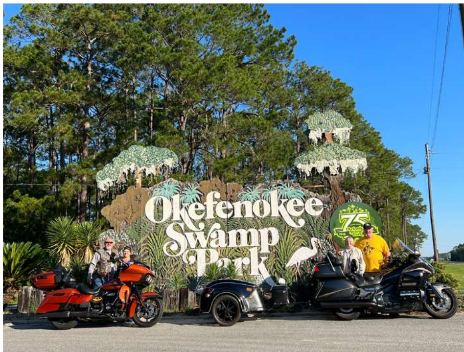
Okefenokee Swamp in South Georgia