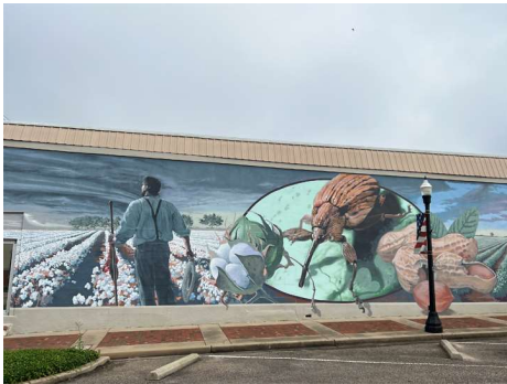
Boll Weevil Mural in Enterprise

this insect, the area around Enterprise switched over to peanuts as their major crop. Since then, the area has thrived! They thank the Boll Weevil for their prosperity!