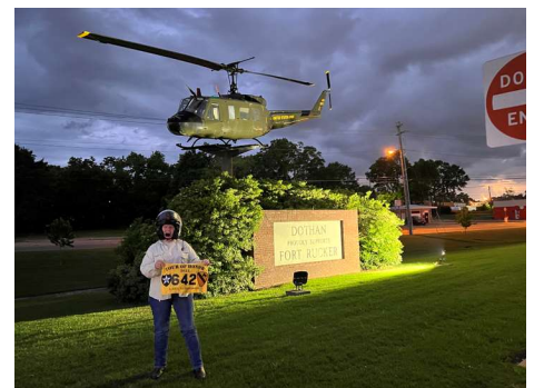
Tour of Honor Huey

The Rodeo Mexican was where we ate dinner. It was great! And, the Margaritas were even better! From here, we stop to get a picture of a ToH Huey Helicopter in the middle of town.